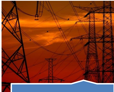
Electricity & Gas