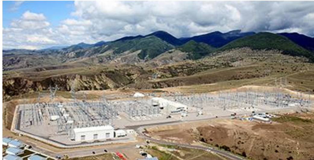
The Akhaltsikhe substation will connect Georgian network with Turkish network.

This linkage will allow Georgia to connect to the Turkish transmission grid and export its green energy.